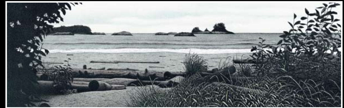
'Panorama - Calvert Island' Lithograph, 2008