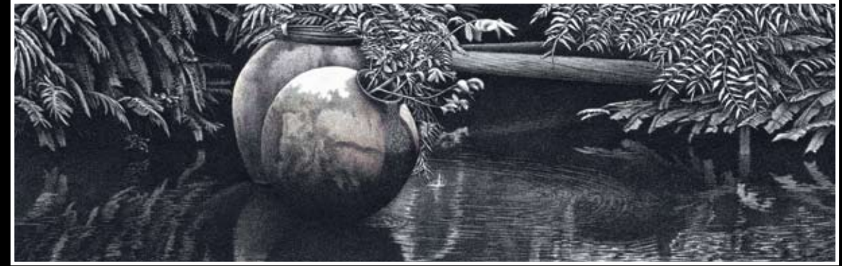
'Balance' Lithograph, 2008