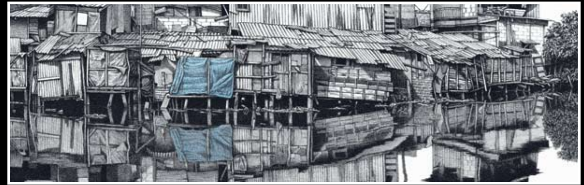
'Reflections - Kali Sunter' Lithograph, 2008