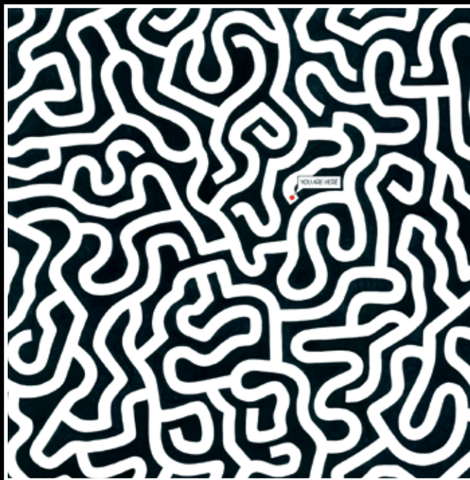
'You Are Here' Pen and Ink Drawing, 2008